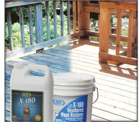
X-180 Weathered Wood Restorer™ Regular and Concentrate*

* CONCENTRATE: 1 gallon makes 10 ready-to-use gallons. May be used up to a 1:10 dilution, covering up to 3,000 sq. ft. per gallon, for light cleaning.