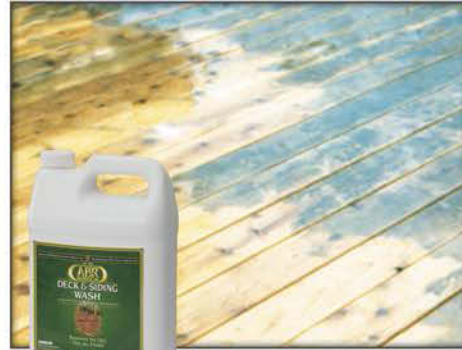
ABR® Deck & Siding Wash