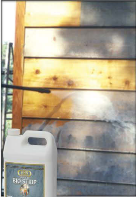
Super Bio Strip™ Liquid and Gel