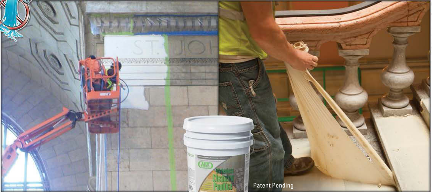
Test application applied at Union Station in Toronto, ON.