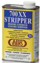
700XX Extra Strength Special Coating Stripper

COVERAGE: Liquid —50 to 150 sq. ft./gal. Gel —50 to 100 sq. ft./gal.